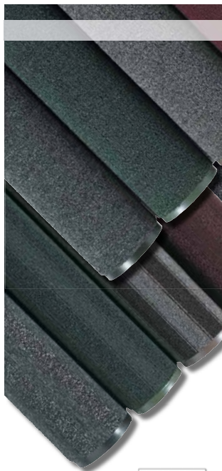
231 Product testing