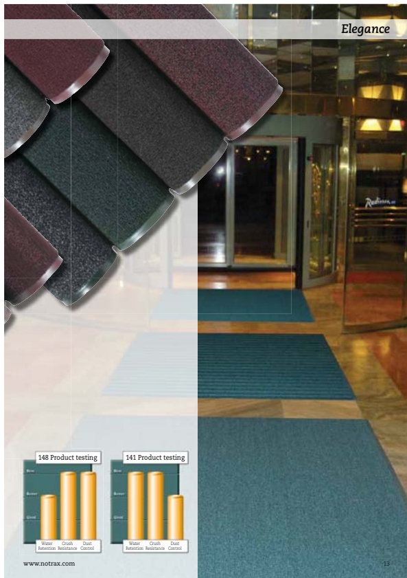
148 Product testing